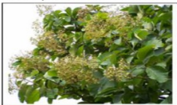
Figure 1: Aerial parts of T. grandis Linn.

Tectona grandis Linn(TG) is commonly known as "teak" of family verbenaceae,large deciduous tree of 30-35 metre tall ( Figure 1 ) with light brown bark,leaves simple,opposite,broadly elliptical or acute or acuminate,with minute granular dots,flowers are white in colour,small and have a plesant smell [3].The plant TG is probably the most widely cultivated high value hardwood(HVW) in the world and it's native to India,Mayanmar and south-East Asian countries. It is now one of the most important species of tropical plantation forestry.The various phytoconstituents isolated from Tectona grandis are Juglone, which has been reported to have antimicrobial activity[4], betulin aldehyde shows anti-tumor activity [5] and lapachol also revealed anti-ulcerogenic activity[6]. Quinone are classified by the aromatic moieties present in this structure and the napthoquinone constitutes the naphtalenic ring [7]. Ortho and para-quinoid based cytotoxins have their ability to generate semiquinone radicals by bioreduction ,which then accelerate intracellular hypoxic profile.Two essential mechanisms are linked to the effect of ( Figure 2 )